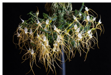
Angraecum arachnites 'Evan Shively' CCE/AOS and FCC/AOS