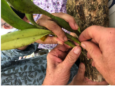
How to mount orchids on trees