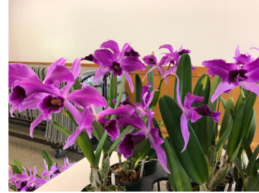
Opportunity Table $50-60 donated cattleyas contributed to robust sale of raffle tickets.