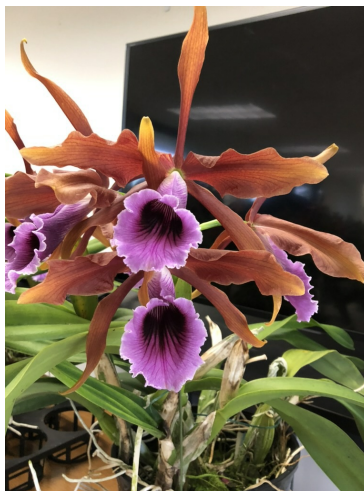
Cattleya tenebrosa 'Good Grief Charlie Brown' AM/AOS