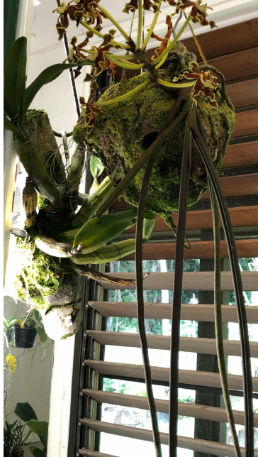
Paraphalaenopsis - amazing 4-5' long terete leaves hanging down to the floor!!