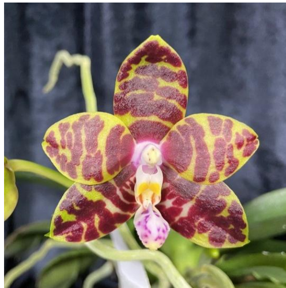
Phalaenopsis Zheng Min Otters